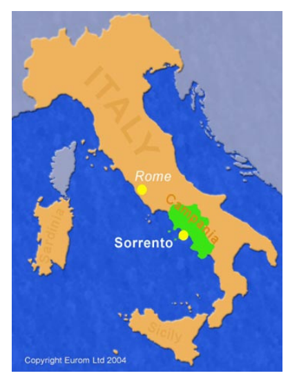
Sorrento in the region of Campania

A number of three star hotels, including the Hotel Zi Teresa, are available and located within walking distance from the heart of Sorrento. Final choice will depend on individual school requirements and hotel availability.