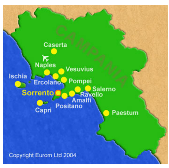
Sorrento and main places of interest

Sorrento is located in the southern region of Campania 54 km south of Naples and central to many historical locations as well as national parks and reserves including Vesuvius, Amalfi Coast and Marina di Punta Campanella.